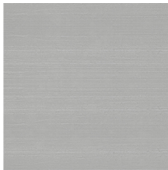
Satin Stainless Satin-SS