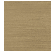
Satin Champagne TP-12