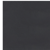
Flat Black PC-8