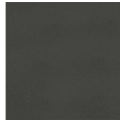
Oil Rubbed Bronze PC-65